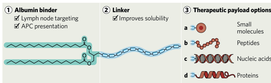
Fig. 1 | A modular conjugation approach for delivery of immune therapeutics to the lymph node. The technology enables a lipophilic tail to bind to a linker domain, which is then able to attach to various types of immunomodulatory payload molecules.

The AMP technology grew out of the multi-disciplinary lab of Darrell Irvine, a biological engineer at the Koch Institute for Integrative Cancer Research